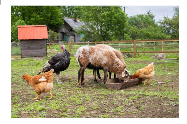
Good management tips for lifestyle blocks.