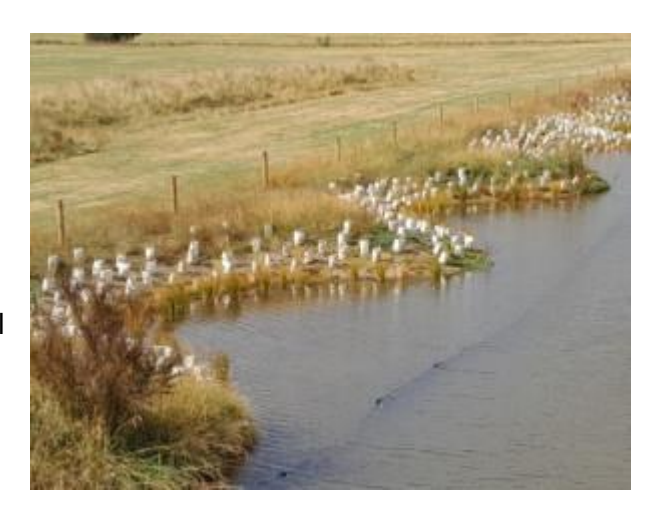
After completion of native planting and installation of a fence in February 2023.

The project focused on 105 metres of Taranaki Stream, requiring regrading and planting to restore the area and allow native fish species to thrive. Six bays