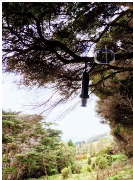
Bat detectors in tree Stony Bay