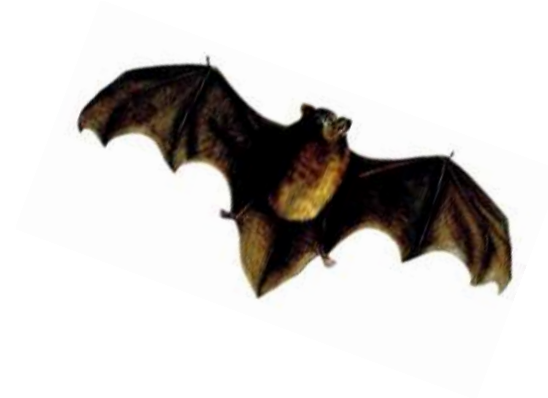
Pekapeka NZ longtail bat