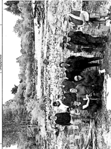
On site summary work completed or in progress