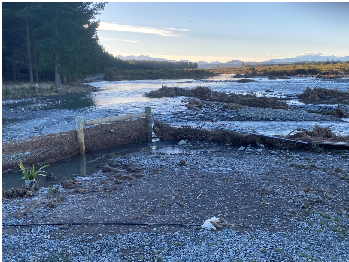
Attachment 2: recharge basin