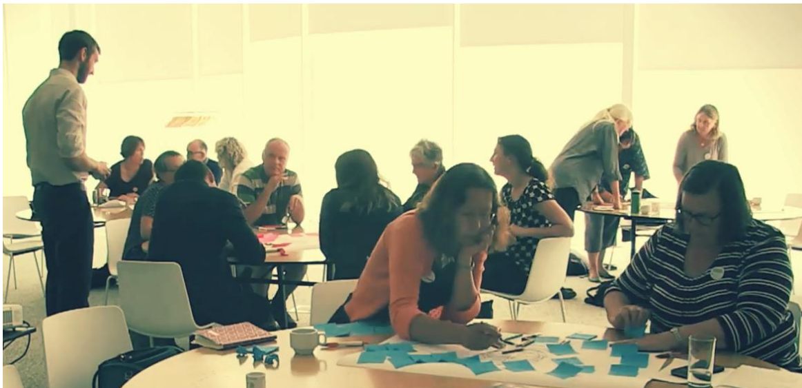
Image 3. Participants talking about why working to improve the environment is important to them.