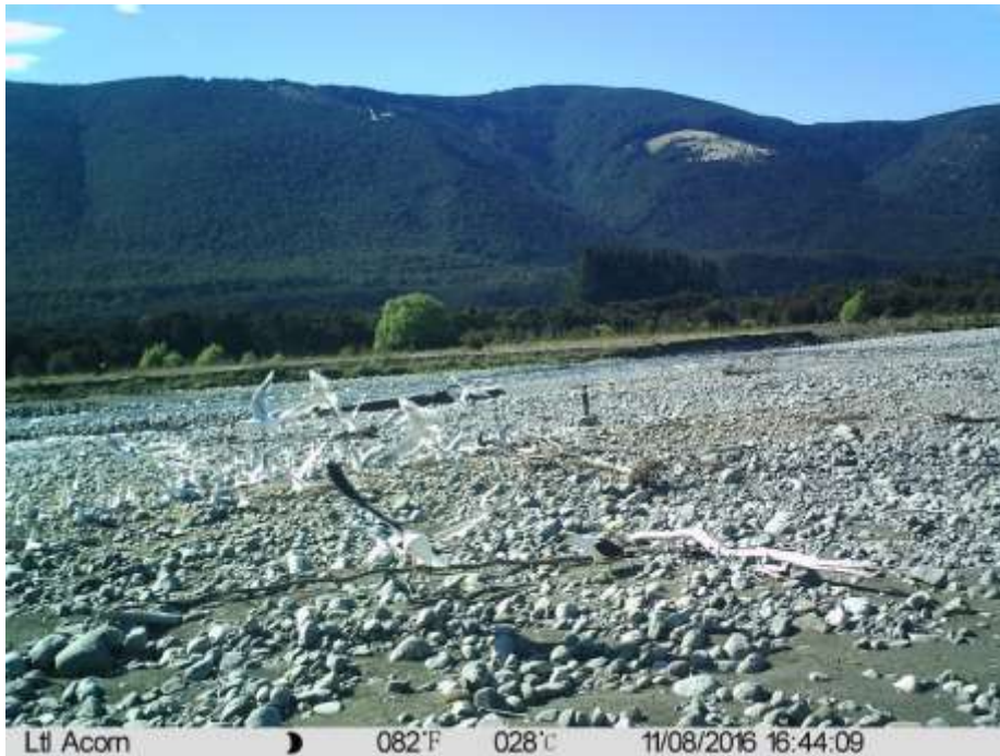
B) SBBG predated BFT nest, Clarence River, Canterbury.