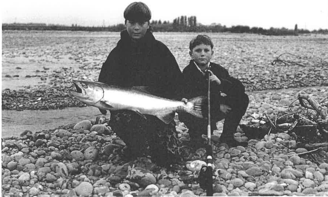
My son and nephew at the Rangitata River 1999. My son is holding his first Salmon.