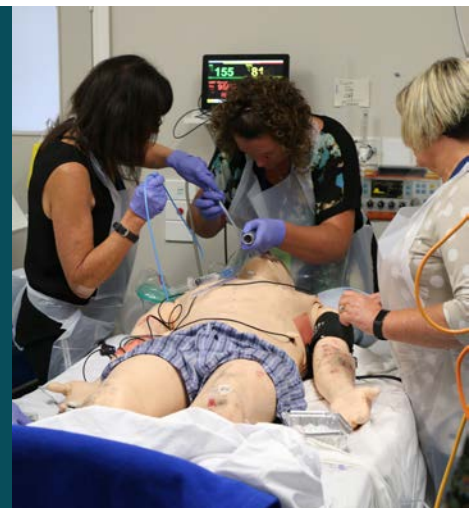
Team work in action – Advance Ashburton, together with our RHAC funding partners, the McKenzie Charitable Trust are pleased that the Ashburton-based centre is recognised as a centre of excellence for rural medicine.

“It drove the point home that you can go to a resuscitation in an emergency setting and people can know how to do things, but if it’s not calmly managed in a good fashion, the outcomes [can be] terrible,” he says. “It’s not about the best drugs to give, or when to shock someone, so much as working as a group – assigning roles of leaders and followers, and having good communication between members. It was quite a change participating in an educational course alongside nurses. Having them there made the simulation exercises seem far more like a real-life situation because that is how it works in rural teams. It also helped