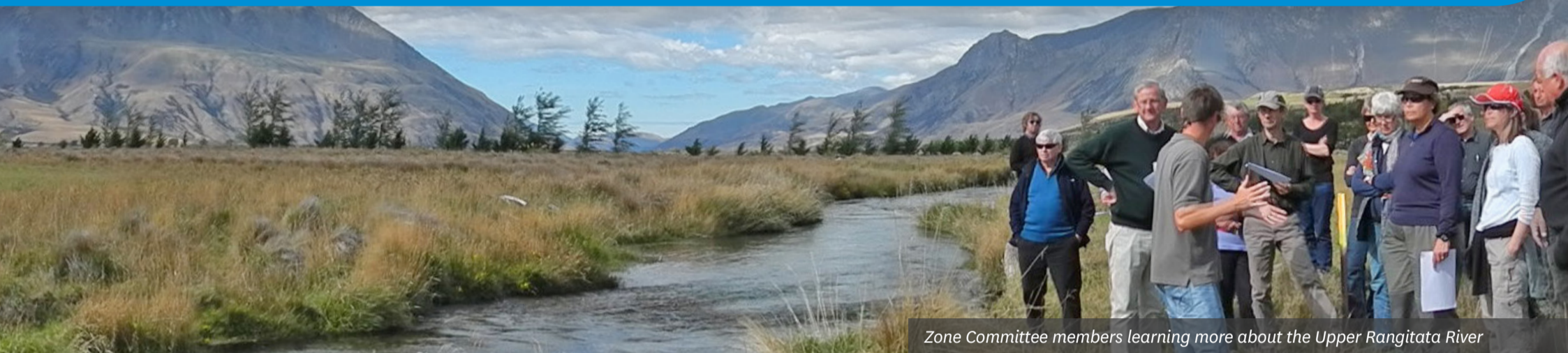
Zone Committee members learning more about the Upper Rangitata River