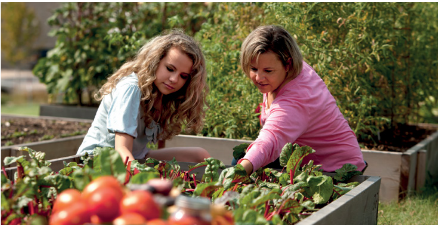
Follow common sense backyard hygiene in your garden.

We have identified the location, extent and relevant information about each site as accurately as possible, using historic aerial photographs matched with current maps. We have also checked council files, when available.