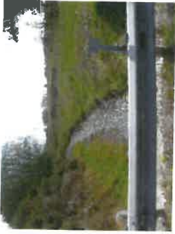
Parakanoi Drain dry