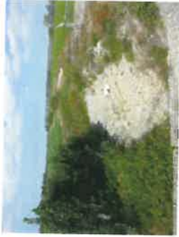
Spicers Drain dry