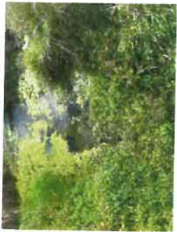
Taylors Drain 0 l/s ponded