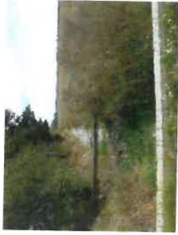
Flemington Drain dry