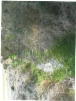
Johnsons Drain dry