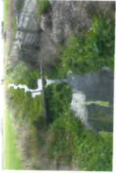
Home Paddock Drain 25 l/s