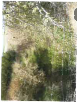
Bells Drain dry