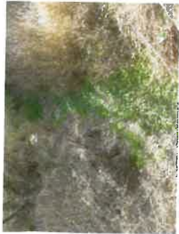
Dawsons Drain dry