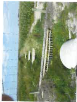
Andersons Drain dry