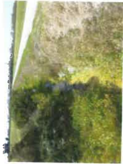
Wheatstone 0.25 l/s from side stream otherwise dry upstream