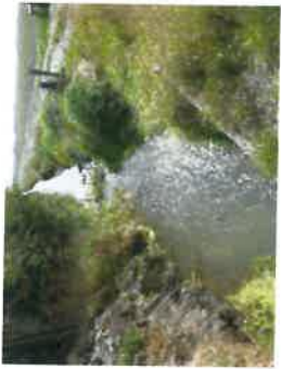
Deals Drain 50 l/s