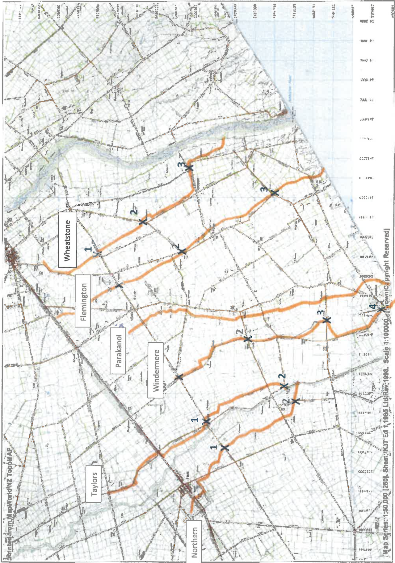
Figure 2. Hinds Hekeao Plains drains sites for monthly nitrate sampling from 8 August 2014 to 21 April 2015.