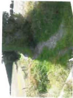
Bleeps Drain dry