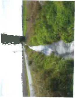
Windermere Drain 35 l/s