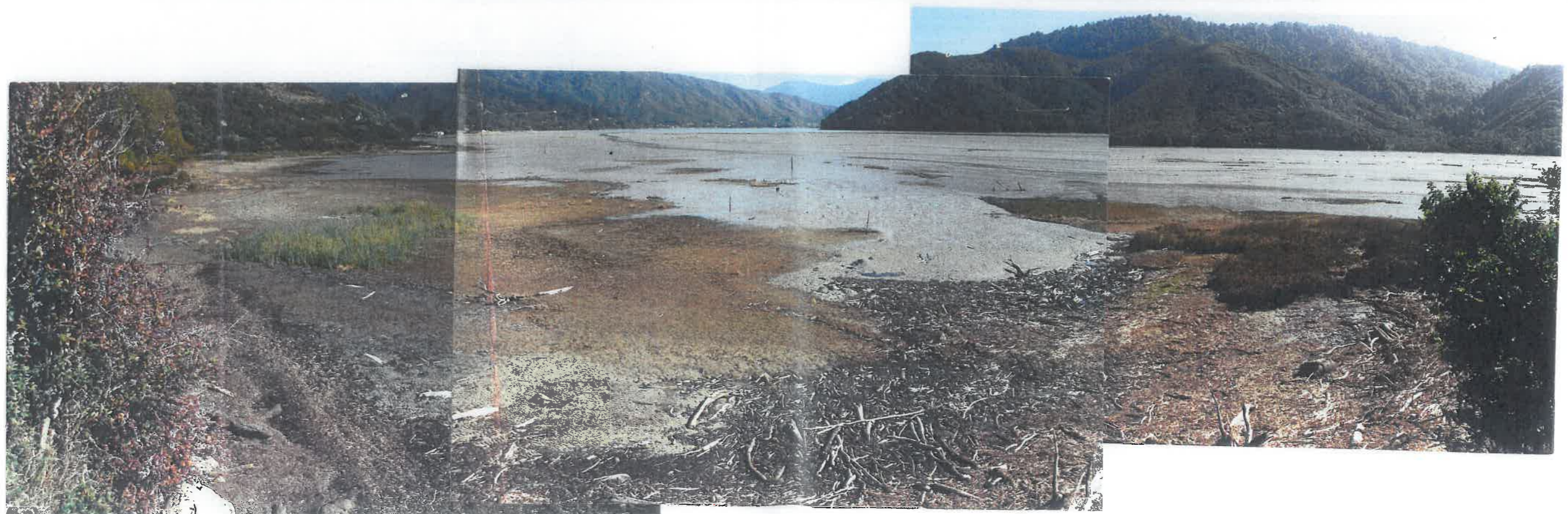
Post Control; March 1998 Note the native rushes unaffected by Gallant