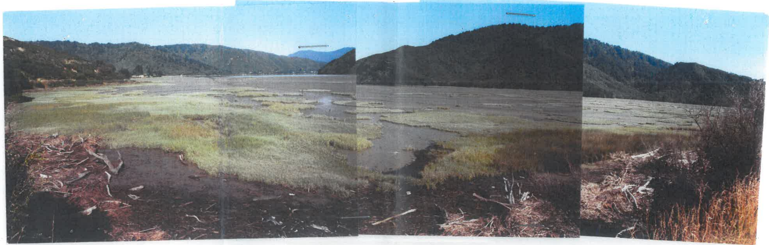
Pre Control; January 1995