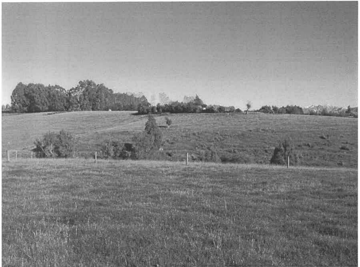
West & South Views Proposed Geraldine/Raukapuka Clean Air Zone