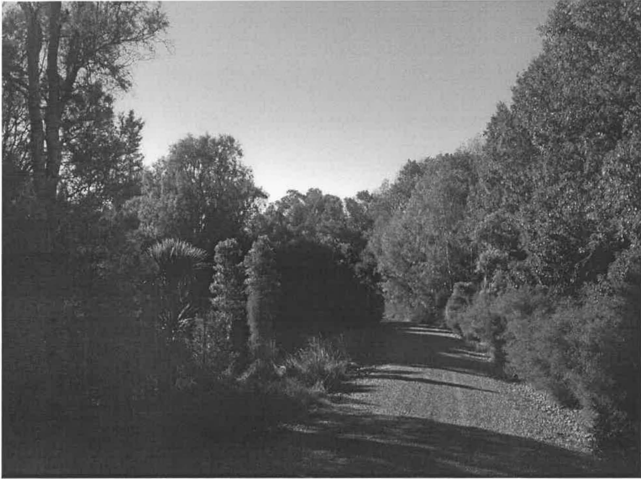
An example of the type of vegetation that can be subjected to adverse weather events at any time of the year when bulky trash has got to be dealt with.